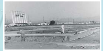
Breaking ground for Rancho Bowl, 1959.