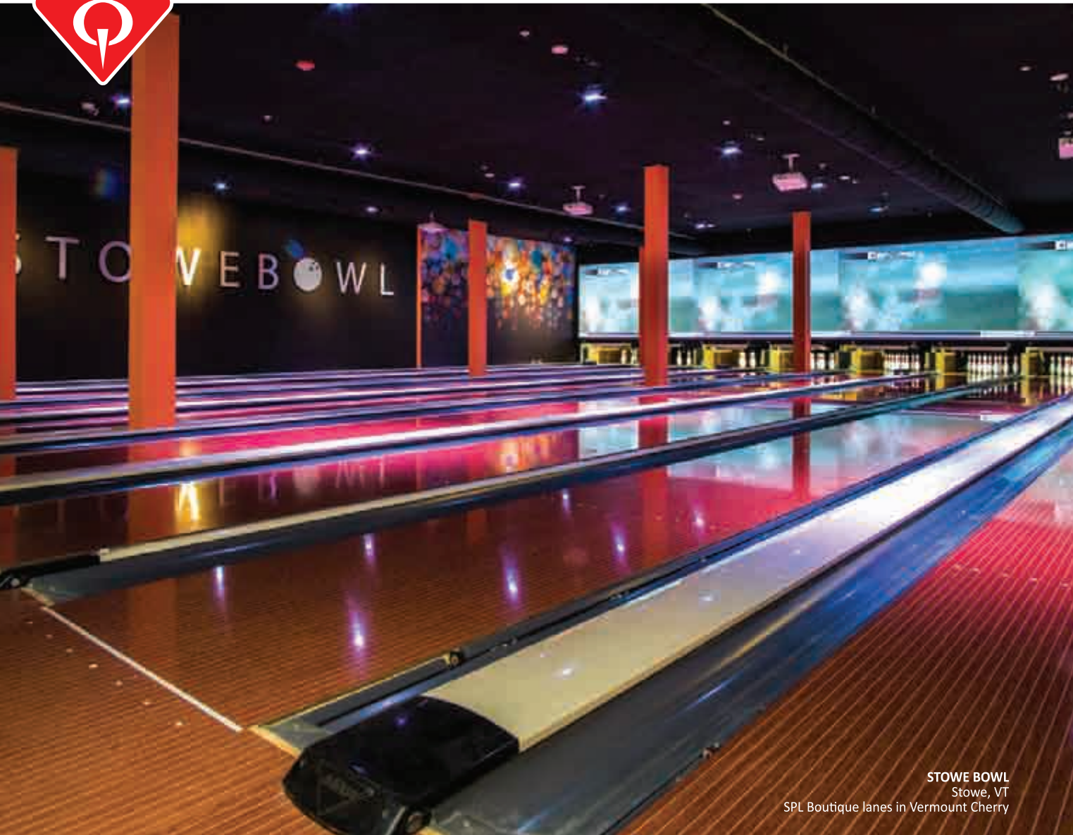
STOWE BOWL Stowe, VT SPL Boutique Lanes in Vermont Cherry