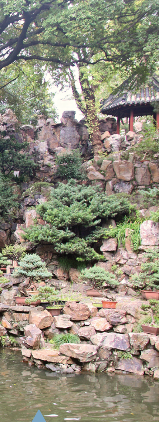
Scenic Route: Beautiful Yuyuan Gardens is one site that made Shanghai a uniquely scenic host for the 52nd QubicaAMF World Cup.