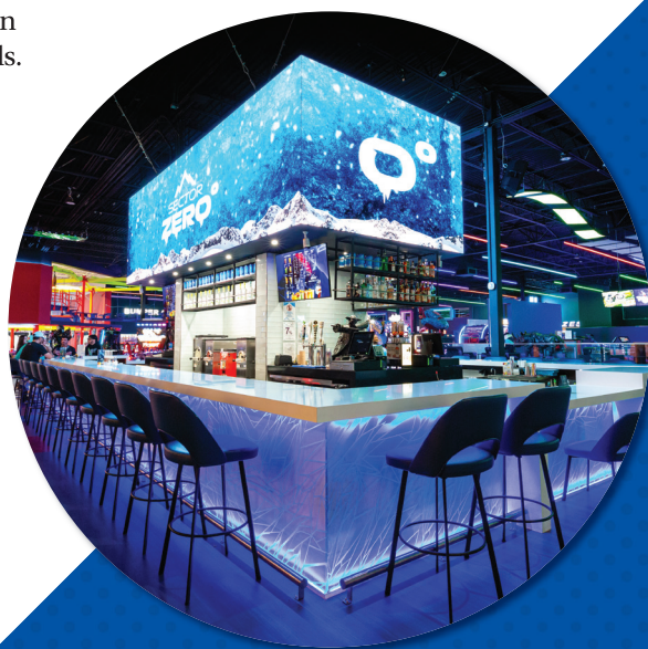
Top: The Game Super Park, Pune, India. Middle left: Walterz Entertainment Centre, Blackpool, United Kingdom. Middle right: King Pins, Manchester, United Kingdom. Bottom: Sector Sixty6, Caguas, Puerto Rico.

(Note: Information in the “At a Glance” listings provided by the entrants.)