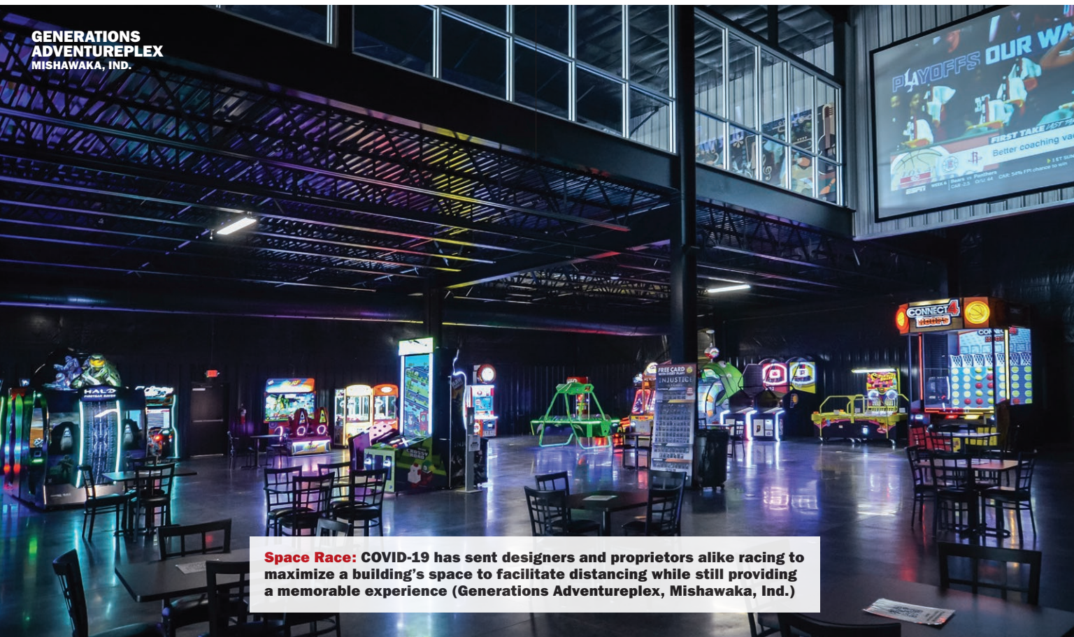
GENERATIONS ADVENTUREPLEX MISHAWAKA, IND.

Space Race: COVID-19 has sent designers and proprietors alike racing to maximize a building's space to facilitate distancing while still providing a memorable experience (Generations Adventureplex, Mishawaka, Ind.)