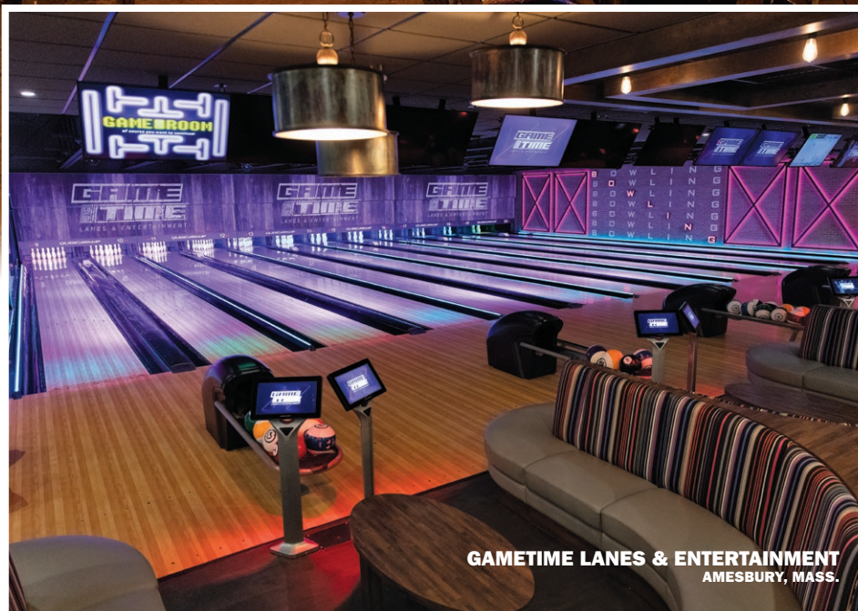
GAMETIME LANES & ENTERTAINMENT AMESBURY, MASS.