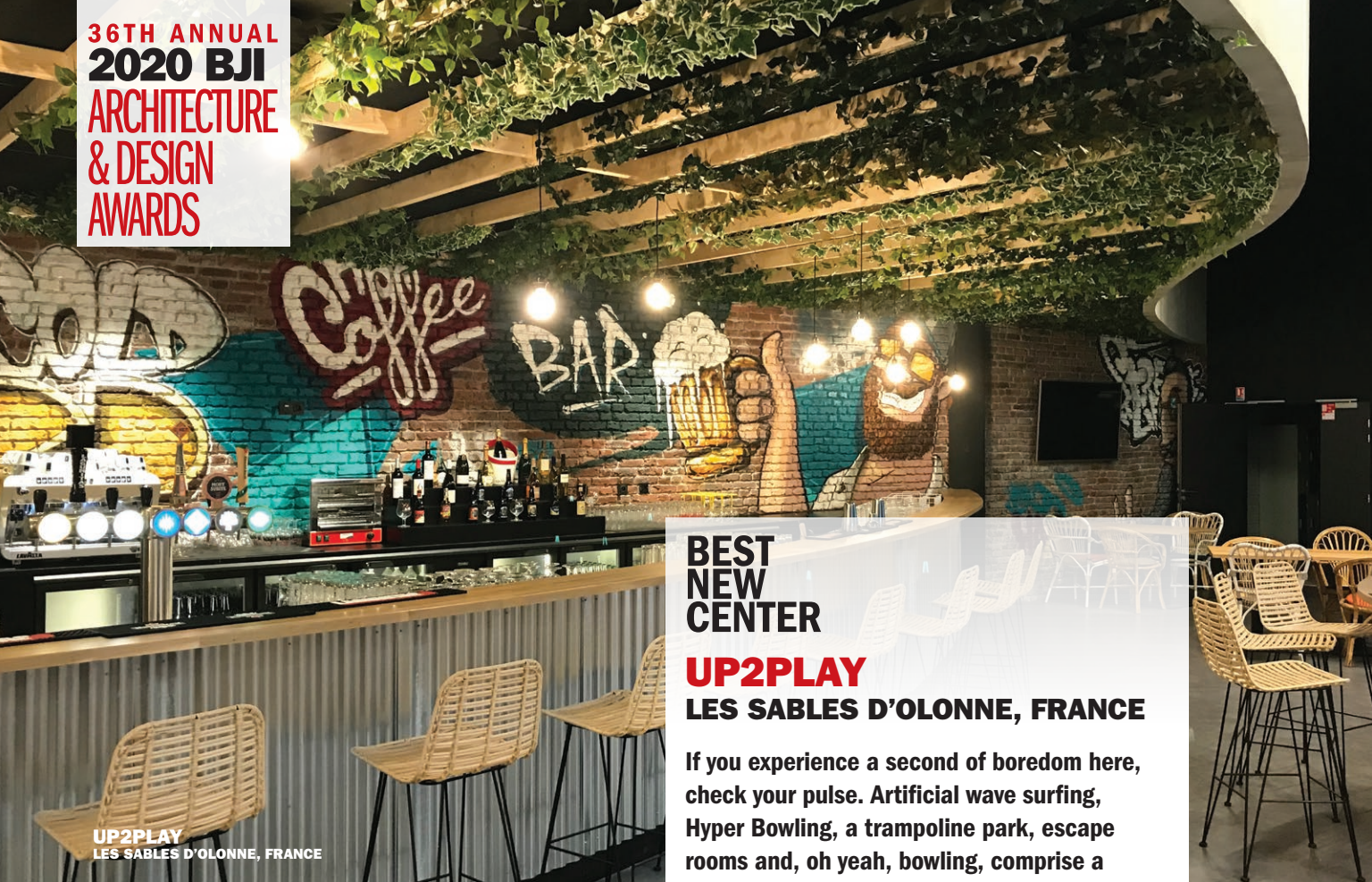
UP2PLAY LES SABLES D'OLONNE, FRANCE