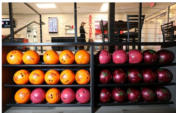
The 300 Club bowling center has done away with old-school black balls and has only a stock of colorful balls for customers to use.