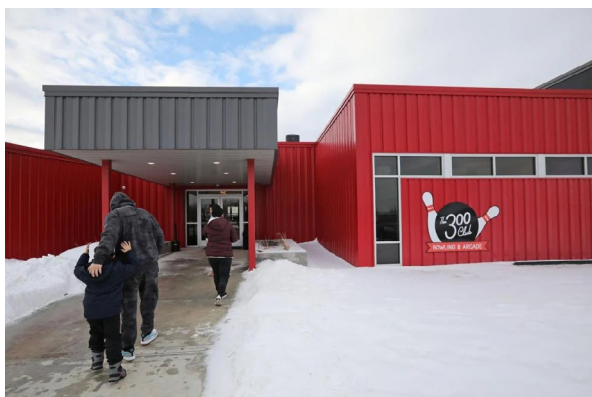
The 300 Club in Green Lake had for decades been a typical small-town bowling alley until a more than $1 million transformation in 2021.