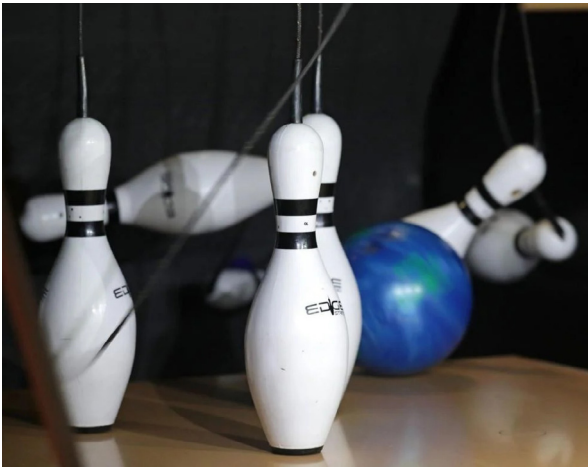
Bowling pins at Club 300 in Green Lake are connected to paracord as part of a string pinsetter system that is less expensive to maintain and operate than traditional pin-setting machines. However, the U.S. Bowling Congress has not yet recognized string pinsetters for use for sanctioned league and tournament play.